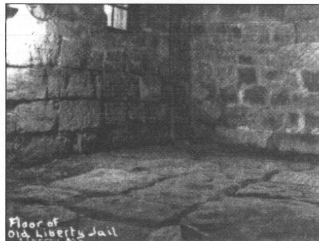
The stone floor of Liberty Jail.