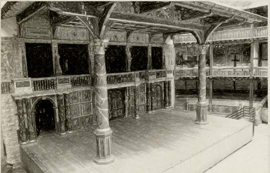
"Shakespeare's Globe" rebuilt in London resembles the original Globe theatre.

What fire is in mine ears? Can this be true? (3.1)