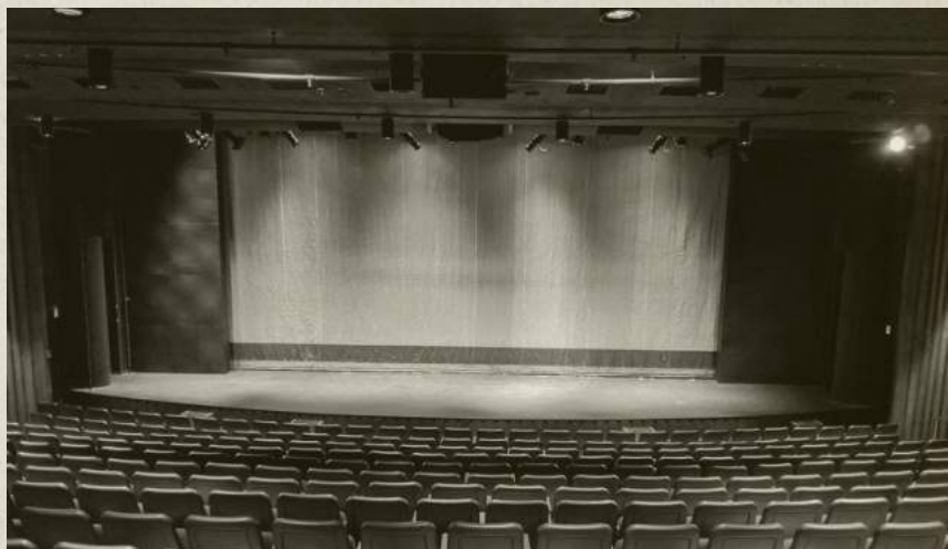
The shape of the Pardoe Theatre before the “thrust” stage was added for this show.