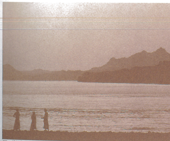
Twilight at Akasha. The Nile in the Nubian Desert.

Of course, our desire is that emotion will also flow from this Aida —emotion from the storytellers on stage flowing freely and being returned by the audience. Such a free-flowing exchange creates a shared experience that patrons long for and only the living, breathing theatre can provide. ▲